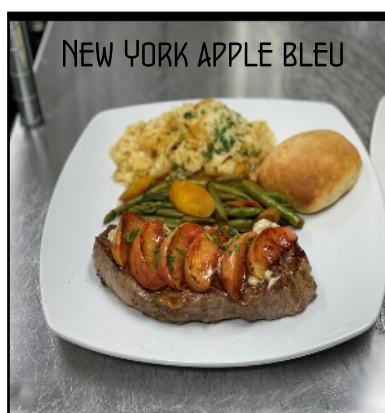
NEW YORK APPLE BLEU