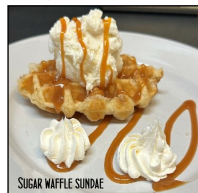
SUGAR WAFFLE SUNDAE

FETTUCCINI NOODLES TOSSED IN OUR OWN RED SAUCE TOPPED WITH CHICKEN, MOZZARELLA & PARMESAN CHEESE.